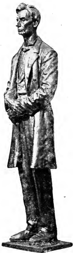
BARNARD'S STATUE OF LINCOLN.